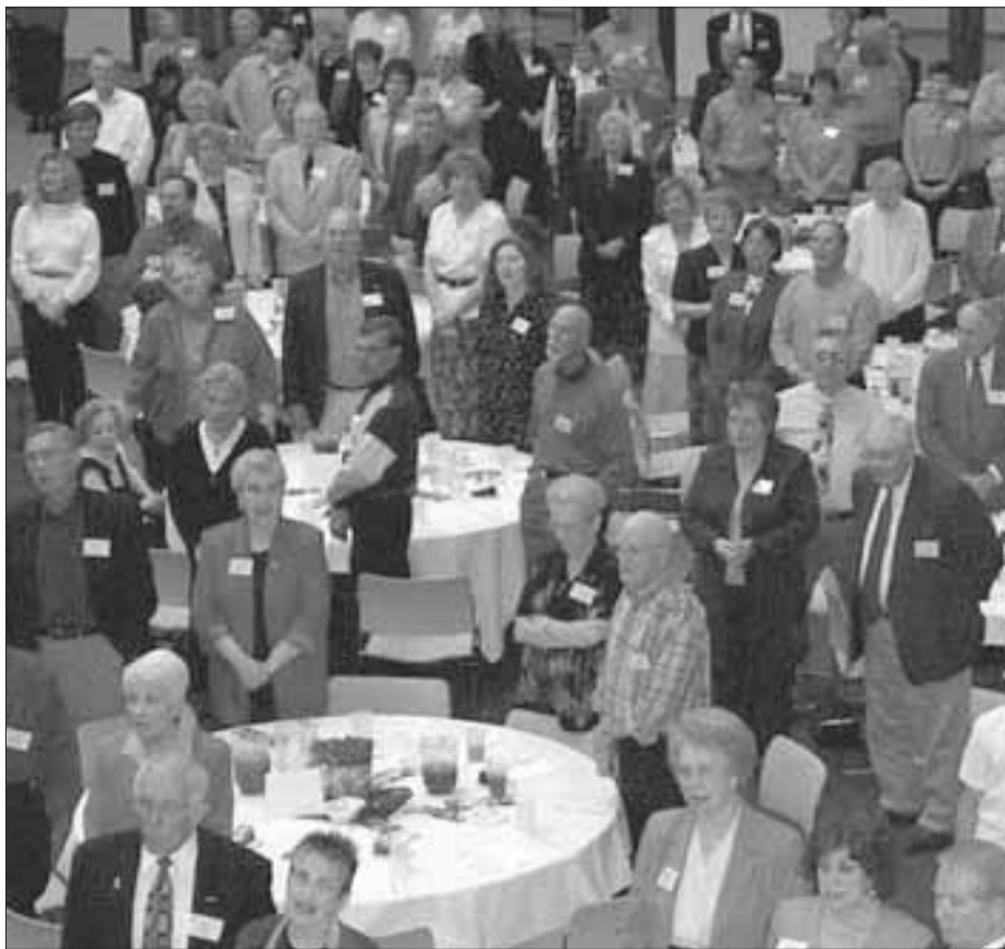
Nearly 1,000 people attended Faith Promise Dinners in Lamesa, Texas; the Dallas/Fort Worth area, Oklahoma City and Colorado Springs.