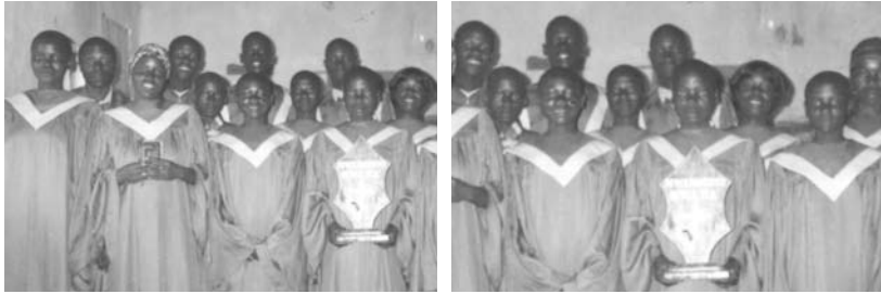
The Kihumulo Baptist Church choir and Katembe Baptist Church choir, both in Tanzania, sport choir robes donated to the churches by Music Evangelism Foundation.