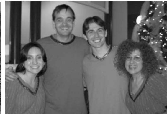
The A.D. Players, through drama and music, performed four skits on the life of Joshua.