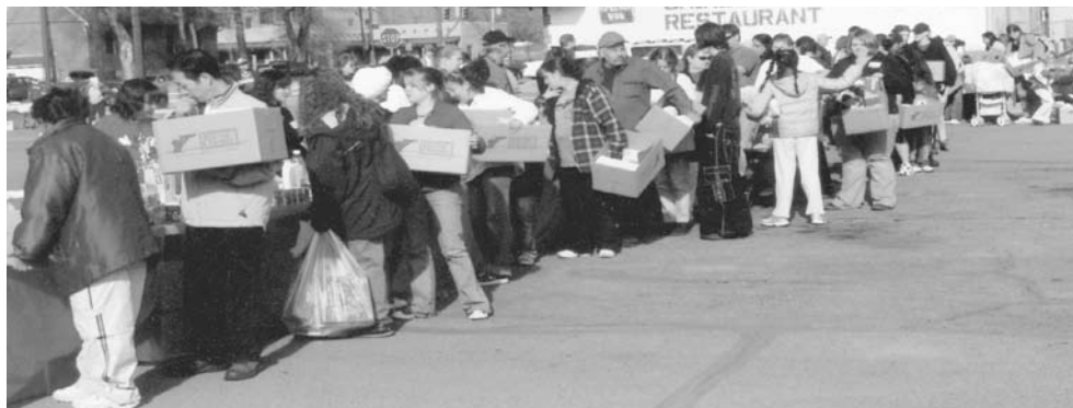
People line up in Colorado Springs to receive food and other items during the MEF Christmas "give-away."

If you would like to help by giving nice toys, clean clothes or other items, such as soap, shampoo, cleaning agents or other items that cannot be purchased with welfare help, bring them to the parking lot at 105 N. Spruce by 9 a.m., Saturday, Dec. 15. Or you can mail the items to our office at 411 Lakewood Circle, Suite 205A, Colorado Springs, CO 80910, or send a check to P.O. Box 6617 to help cover expenses. You'll be glad you helped, and God will bless.